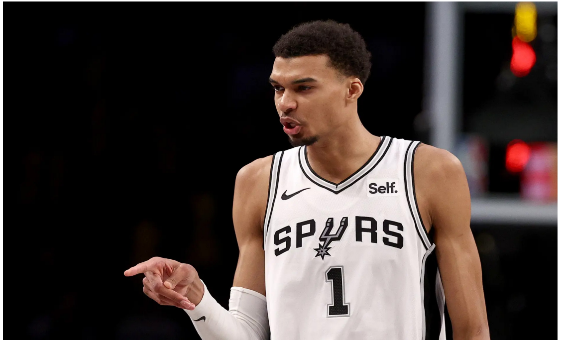
Victor Wembanyama led the NBA with an impressive 3.6 blocks per game.

Wembanyama was also an excellent scorer over the past season. His alien-like physique seems to make scoring a menial task for him, yet Wembanyama pushes himself to score in various ways. Most surprisingly, his off-the-dribble 3-point percentage was 41.3%, tying with elite guard and shot-creator Shai Gilgeous-Alexander. This only further highlights his capacity to craft his own buckets and his shiftiness at his monstrous size. His unanimous-ROTY-winner predecessors failed to even come close to such shot making. Greg Popovich, the San Antonio Spurs coach, played Wembanyama at power forward, a move unprecedented for