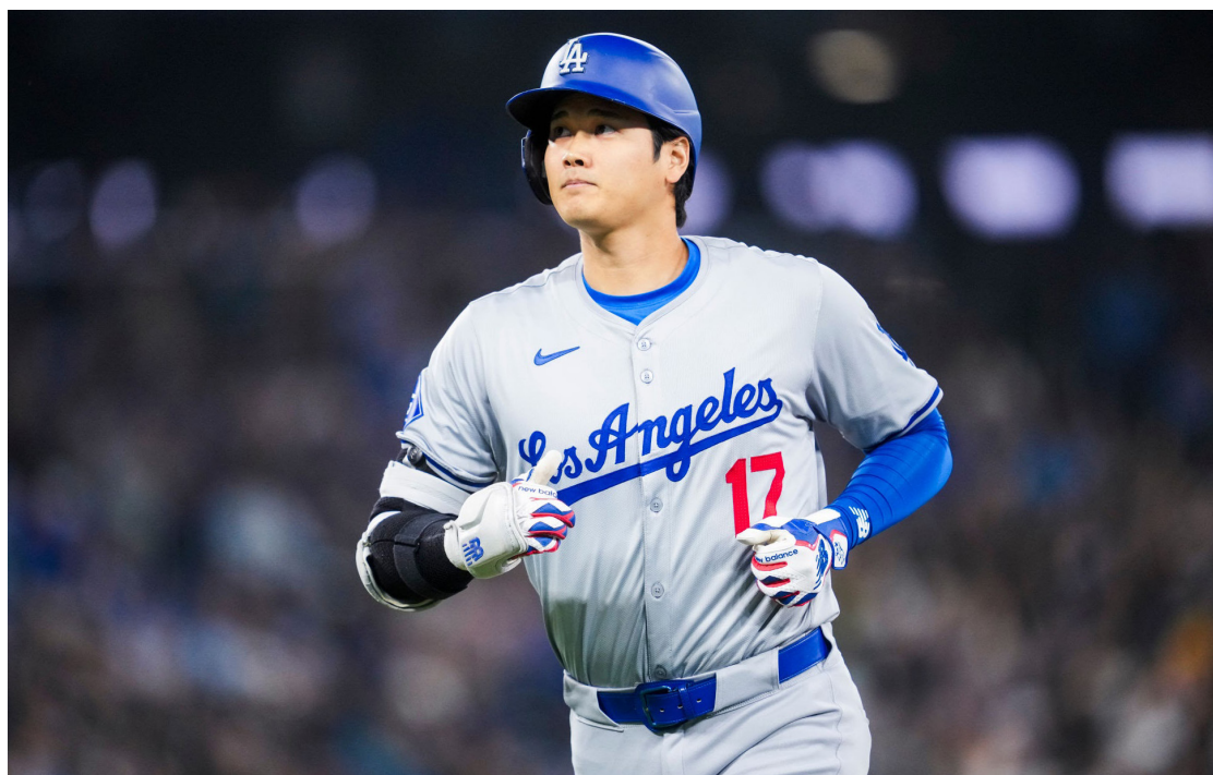
Shohei Ohtani looks out to his adoring fans at Dodgers Stadium in Los Angeles.

best, he will likely continue to pitch. Only time will tell how he heals.