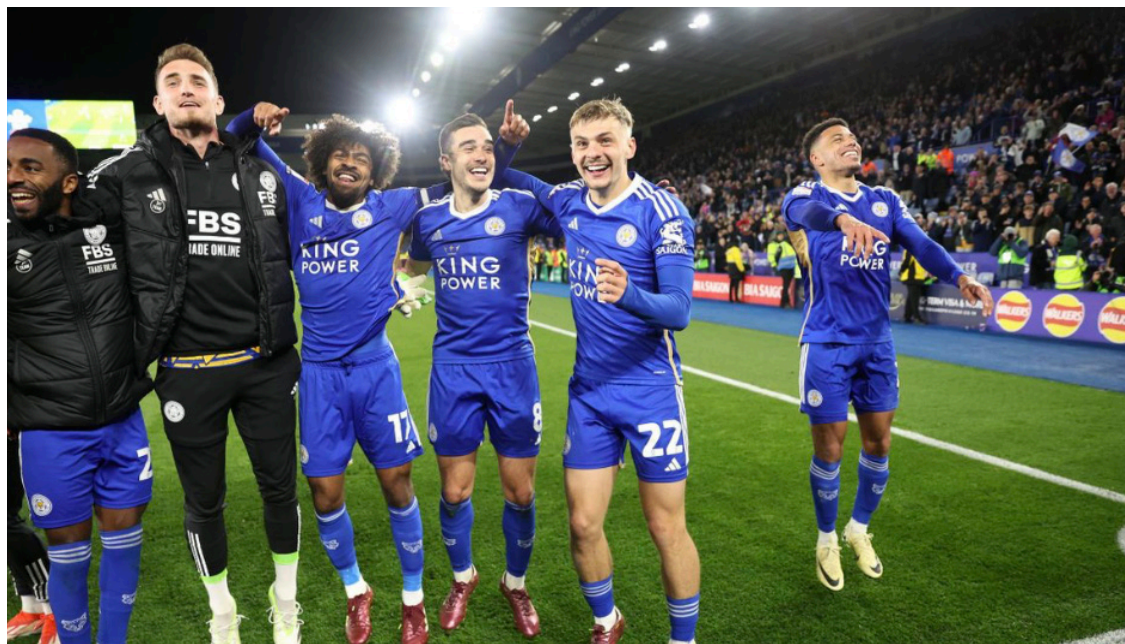
Leicester City players celebrating after confirming promotion to the Premier League.

A mid-season loss of form allowed Leeds and Southampton to put real pressure on Leicester as the season entered its final months. They even found themselves in third place at the start of April, but a convincing 5-0 victory against Southampton restored confidence within the team and propelled them towards a spot in the Premier League.