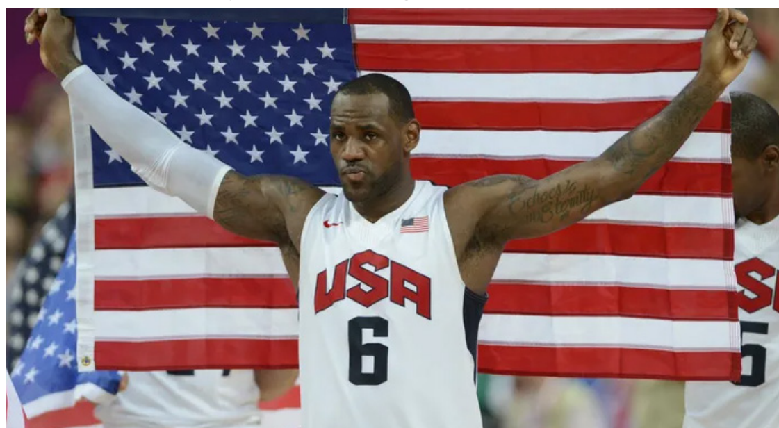
LeBron James celebrates after winning the gold medal in the 2012 London Olympic Games.

With the NBA becoming more and more global, there is increasing doubt about this team's ability to win it all. With teams like France, headed by Rookie of the Year Victor Wembanyama, Slovenia, represented by European sensation Luka Doncic, Serbia, led by MVP Nikola Jokic, Greece, Canada, and Germany all deemed as contenders, it will be interesting to see how Team USA performs in the upcoming 2024 Paris Olympic Games.