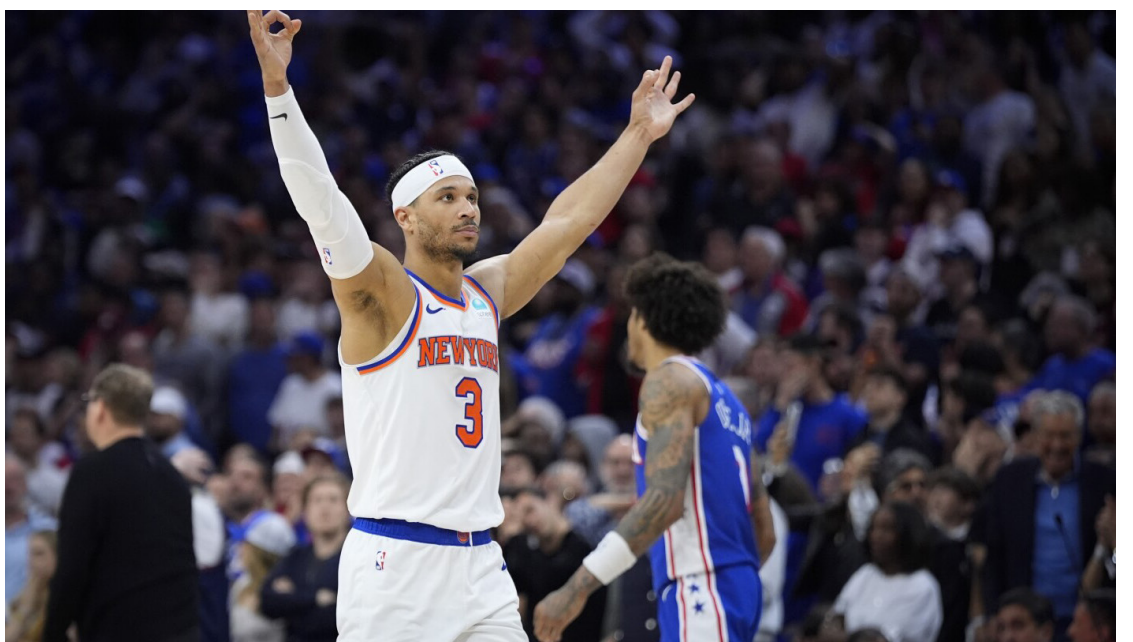
The New York Knicks defeated the Philadelphia 76ers to advance to the Eastern Conference semifinals.

to a close, the stage is set for even more intense and thrilling matchups in the second round. With surprising sweeps, tactical victories, and standout performances, the competition has only just begun. The teams that have advanced now face even tougher challenges, and the excitement and unpredictability of the postseason are sure to continue. Fans can look forward to more high-stakes battles as the journey to the championship heats up.