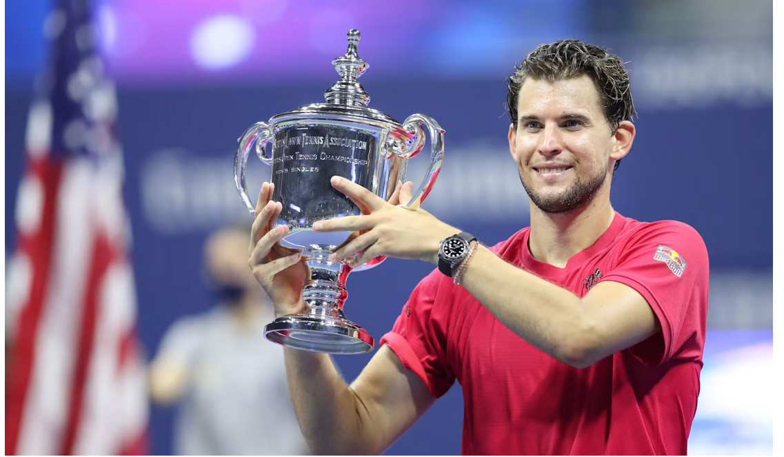
Dominic Thiem after winning the 2020 US Open over Alexander Zverev.

In 2021, Thiem looked to be a top competitor for future Grand Slam events. Unfortunately, he suffered a minor wrist injury which kept him off the ATP Tour for 10 months, plummeting his ranking to outside the top 350. Wrist injuries are common in the tennis community, but remain